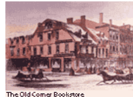
The Old Corner Bookstore